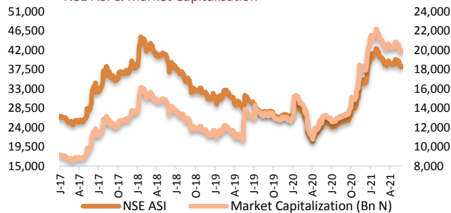
NSE ASI & Market Capitalisation

The domestic bourse reversed yesterday's gains as the All-share Index moderated by 0.78% to close at 37,658.26 points following sell-offs on heavy weight stocks. Consequently, the year-to-date loss of the NSE ASI rose to 6.48%; albeit the Exchange printed more gainers (25) than losers (10) at the close of trading session. Specifically, heavy weight stocks such as DANGEM, MTNN and FLOURMILL declined by 3.91%, 1.21% and 0.17% respectively amid sell pressure. However, performance was positive as three out of the five indices tracked closed in green zone; the NSE Banking, NSE Insurance and NSE Consumer Goods indices rose by 1.02%, 1.51% and 0.14% respectively. On the flip side, the NSE Oil/Gas and NSE Industrial indices fell by 0.09% and 1.96% respectively. Meanwhile, trading activity was upbeat as total deals, volume and value of stock traded rose by 11.49%, 21.09% and 31.64% to 3,630 deals, 0.20 billion units and N2.4 billion respectively. Elsewhere, NIBOR and NITTY moved in mixed directions across maturities tracked. In the OTC bonds market, the values of FGN bonds fell for most maturities tracked; also, the value of FGN Eurobond fell for all maturities tracked.